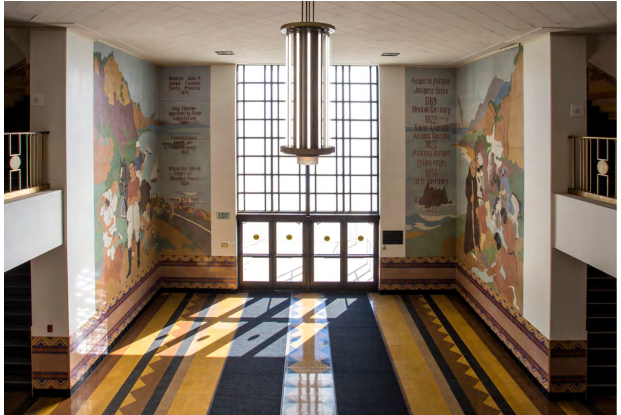
Santa Monica City Hall

Use the worksheets on the following pages to reflect on the images of the mural and imagine potential responses to it.